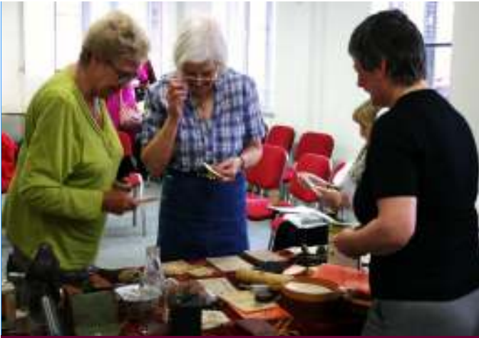
Bolton Museum held an Interactive Reminiscence workshop at the Bolton Women's Forum.