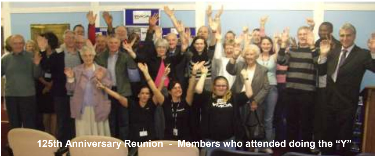
125th Anniversary Reunion - Members who attended doing the "Y"