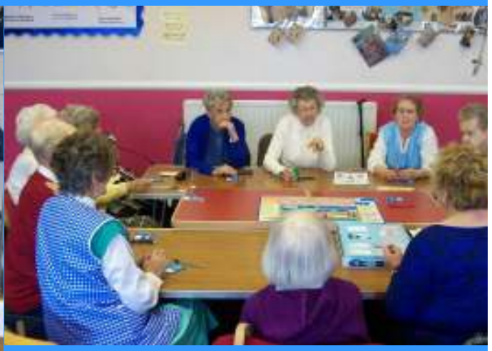
Young at Heart Group - "We played an interesting game and had fun together it lifted our spirits".