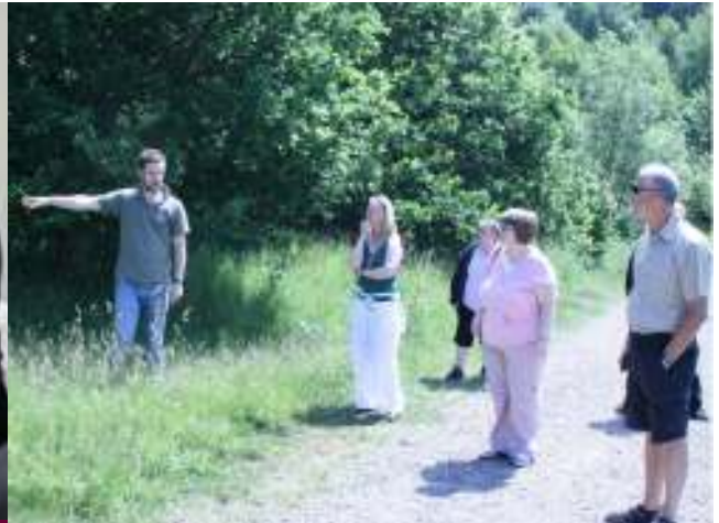
Brightmet Neighbourhood Network - Lancashire Wildlife Trust gave a tour of Seven Acres.