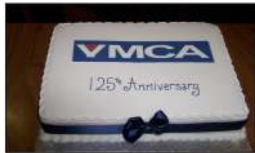
Anniversary cake kindly donated by Greenhough's Bakery

The event was a great success allowing members to meet one another and share past experiences. Some members even rekindled old friendships. The exhibition was greatly received by members; everyone having a look at the history of the YMCA across 125 years. The exhibition ranged from 1884 to 2010. The exhibition itself will also be shown as an exhibit in Bolton Library after 29th July.