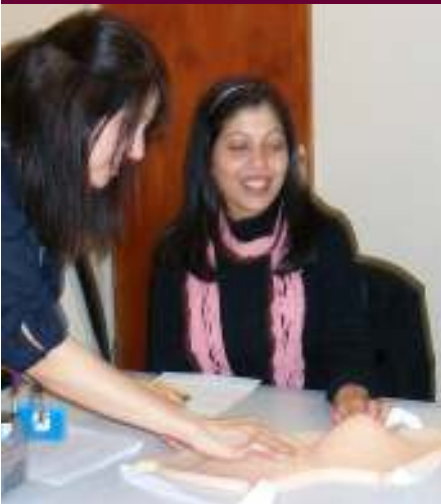
Members from South Asian Women's Carers Group taking part in a Hands On Cancer Campaign workshop.