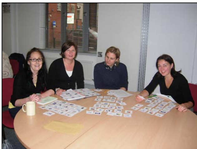
On left, Sustainability Workshop at the Cleaner Greener Forum

There are also opportunities for members of the Forum to represent the Forum on the Cleaner Greener Partnership and one of its sub-groups, the Bolton Food Growing Group. The position of Chair is also open to be held by a member of the Forum. We now have a Representative of the Forum who attends the Bolton Food Growing Group meetings and feeds back to the Forum on any key issues and vice versa.