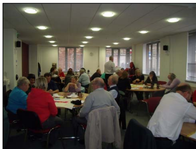
On right, Behavioural Change "Litter" Workshop at the Cleaner Greener Forum